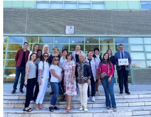
Watch the video of Valladolid Study Tour